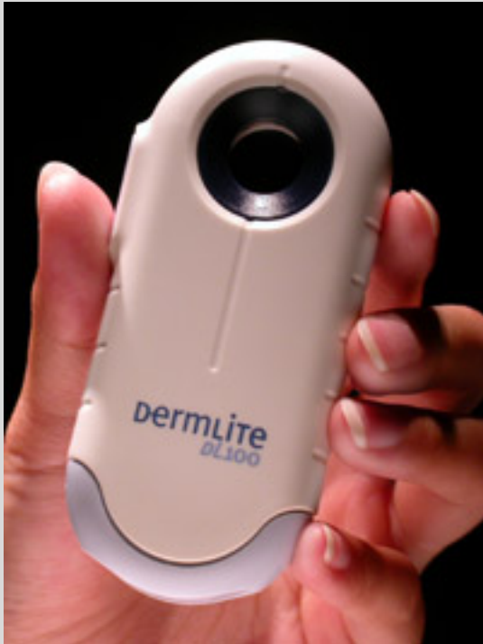
The DermLite line of devices not only enable the trained eye to detect skin cancer and other types of skin conditions early, but this digital microphotography system has been reported to be highly useful in documenting the nailfold vascular changes observed in a small sample of patients with dermatomyositis (Sontheimer RD, J Rheumatol. 2004, Mar;31(3): 539-44).